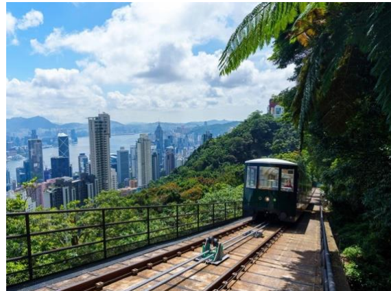
Gaze across Hong Kong and Kowloon from The Peak